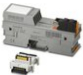
Left-alignable Ethernet interface, for connection to a compatible modular controller from the PLCnext Control range.

Extension module - AXC F XT ETH 1TX - 2403115