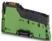
Right-alignable Inline adapter terminal (INTERBUS master) for one PLCnext Control device for setting up a PLCnext Technology Inline station

Extension module - AXC F IL ADAPT - 1020304